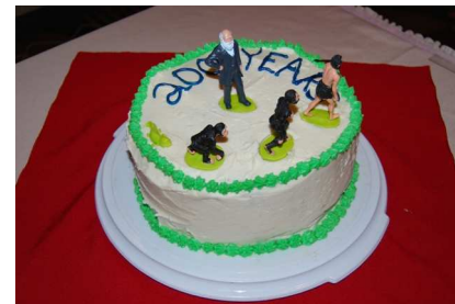
Heather's delicious Darwin cake