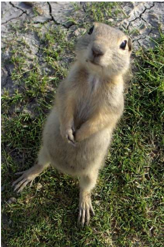
Both garter snakes and ground squirrels hibernate during our winters (the garter snakes actually "brumate")

On Sunday, February 22 nd , HAM organized a field trip to Oak Hammock marsh, just a short distance north of Winnipeg.