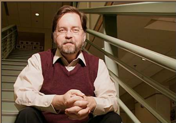
PZ Myers, biologist and writer of the science blog Pharyngula

Published by and for the Humanist Association of Manitoba