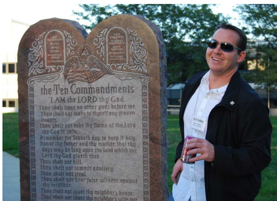
We visited the 10 Commandments monument in downtown Fargo