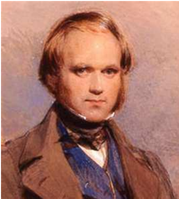
C. Darwin, Esq.